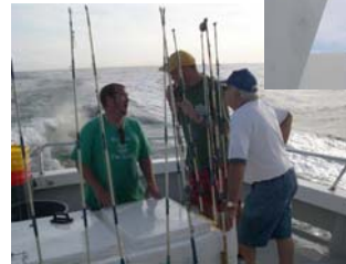
And playing here...