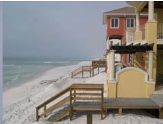
Imagine staying here ...